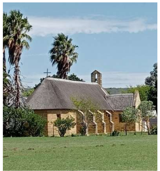
Permits to remove these trees have already been obtained from Heritage Western Cape and work will start beginning May. The other palms ( Phoenix canariensis ) on the border with the Village Green will remain.